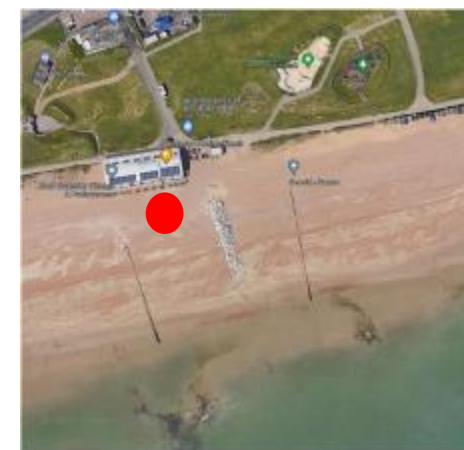
4: Lancing Green. Lancing lance.fines.switch