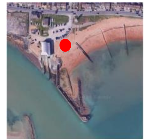
6: Kingston Beach giant.cones.puddles