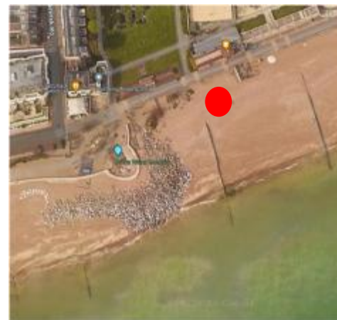
3: Splashpoint—Worthing admiral.active.blame

Note : Paddlers must pass around the end of Worthing pier at a safe distance.