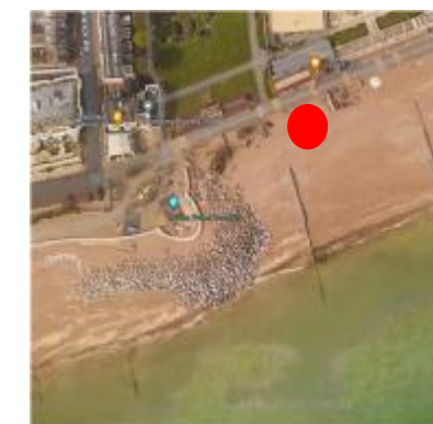
3: Splashpoint—Worthing admiral.active.blame