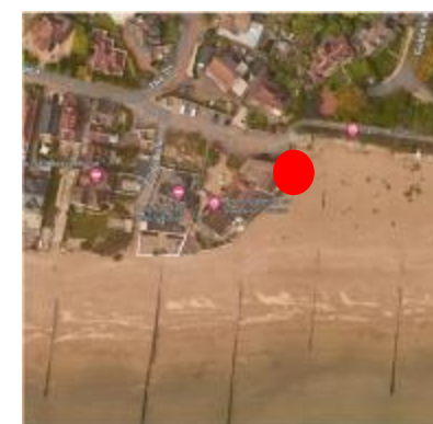
1: Amering Beach House filer.decking.scooped