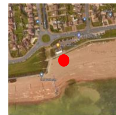
2: Sealane Café glitz.wire.inform