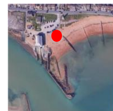
6: Kingston Beach giant.cones.puddles