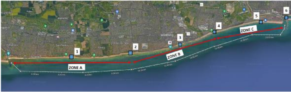
Saturday Plan A Race : Littlehampton to Shoreham (Westerly, Southerly Northerly Winds)