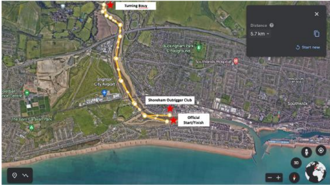
Saturday Plan C Race : Shoreham River Adur Up and Back (Too windy for racing at sea)