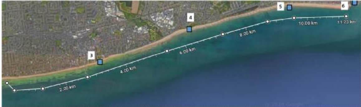
Sunday Plan A Race: Worthing Sailing Club to Shoreham Harbour